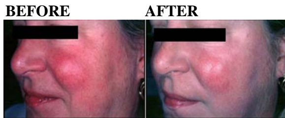
Unretouched Clinical Photos

Because Rosacea is a chronic condition, treatment is considered a means of controlling the symptoms. Patients can expect to manage symptoms with ongoing treatment at the discretion of patient and doctor. They can also monitor their rate of condition flare up.