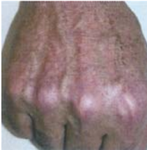
AFTER – Unretouched Clinical Photo

Skin conditions that can be treated with the Palomar MediLux ™ include: