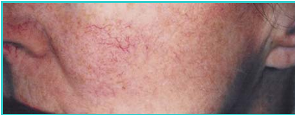
Vascular Lesions/ Broken Capillaries Facial Area